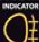
FOG LAMP INDICATOR