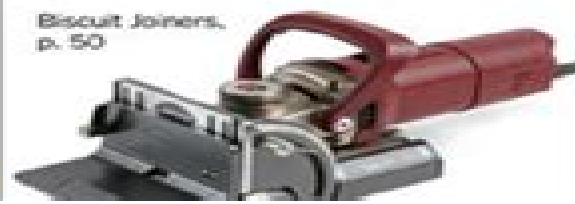
Biscuit Joiners, p. 50