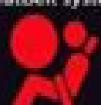
Airbag and seatbelt system