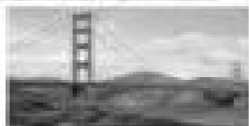
The Golden Gate Bridge

Read the selection and answer the questions to each question. Read the selection and answer the questions to each question. Read the selection and answer the questions to each question.