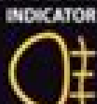
FOG LAMP INDICATOR