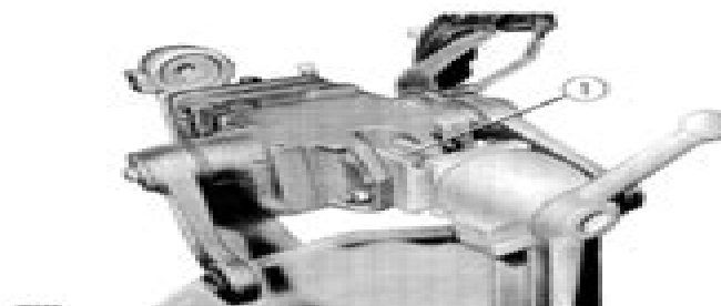
Installation of lift on rotary stand

1. Bracket 50013 to two words in parentheses