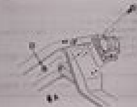
MODELS WITH BEAM AXLE (RPO P50)