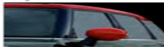
Chili Red JCW models only

Also available on MINI Electric Hardtop 2 Door: Vigorous Grey mirror caps (not shown).