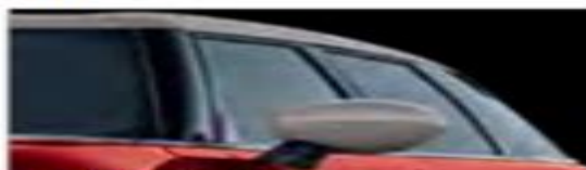
Melting Silver Clubman & Countryman models only