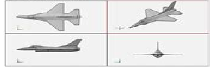
Fig. 2. Four-view of the VSPAero 3D model for the F-16

analyzed using VSPAero tool, a potential flow solver developed by NASA Ames. A low-fidelity 3D model was made according to the best knowledge acquired, and the results of the software analysis were compared with those obtained from analytical calculations to validate the accuracy of the results and provide a more comprehensive understanding of the aircraft's behavior in straight and level flight. The four view and one isometric view of the 3D model is shown below: