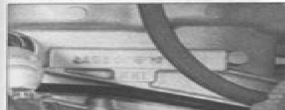
The engine number is located on the right side of the crankcase

Whether buying new, used or rebuilt parts, the best course is to deal directly with someone who specializes in parts for your particular make.