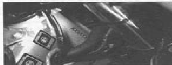
The frame number is stamped on the steering head . . .

* This digit in the frame number changes from one machine to another.