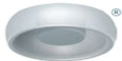
Clear High Retention

Dual retention, pivoting action provides resiliency