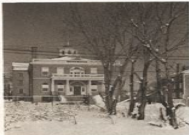
THE CUSTOM HOUSE (1819)