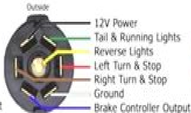
7-Way RV Standard (5th Wheel/Travel Trailer/Camper)