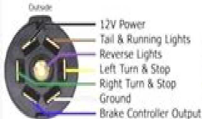
7-Way Traditional (Utility/Equipment/Cargo Trailers)