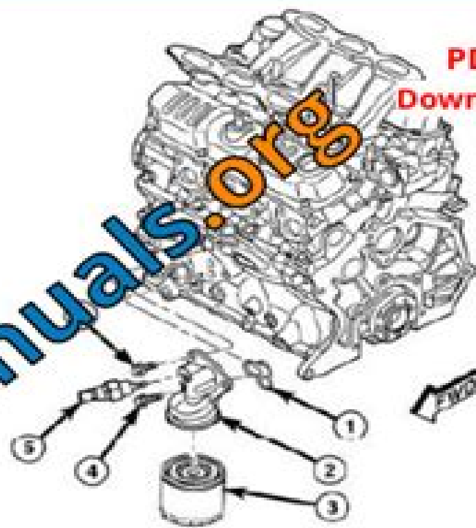
Fig. 156: Removing/Installing Oil Filter Adapter