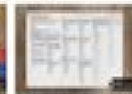
Copyright Clearance Center 222 Rosewood Drive Danvers, MA 01923 Tel: 978 750 8400 Fax: 978 750 4744 www.copyright.com