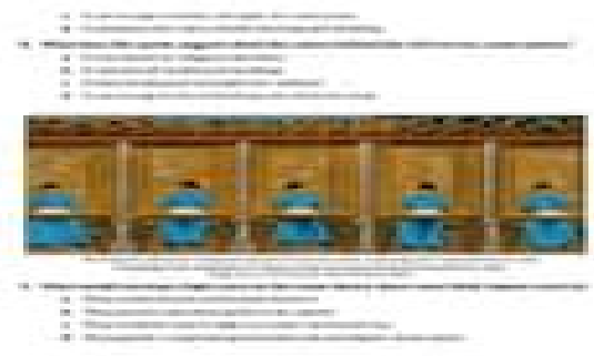
Page 3: Government