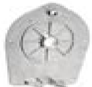
Wireguard WP-3023 Antenna Base Plate 100 $15.95 - 100% - 100% Only 1 left in stock - order soon ★★★★★ = 3