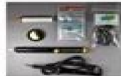
LED 42LW1000-UB PCB-PW Complete Repair Kit w/ 21 Capacitors and Soldering Accessories (Soldering Iron) $29.21 ★★★★★ = 3