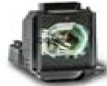
TV Lamp 9150000001 with Mounting for Mitsubishi TV $29.75 - Philips / MITSUBISHI ★★★★★ = 4