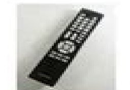
Whisper Remote Control Part Number: 2007000001 $24.95 Only 1 left in stock - order soon ★★★★★ = 3