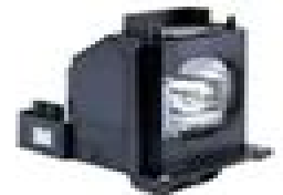
9150400001 - Lamp With Mounting $29.00 - Philips / MITSUBISHI ★★★★★ = 4