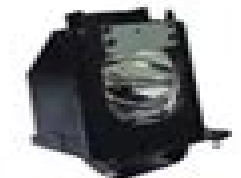
TV Lamp 9150000001 for 9175000001, 9175000001, 9175000001, 9175000001, 9175000001, 9175000001, 9175000001, 9175000001, 9175000001, 9175000001