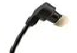
TV 9500A 400007 Ear Tabs for TV Ears - 5 per More Details: Item $29.95