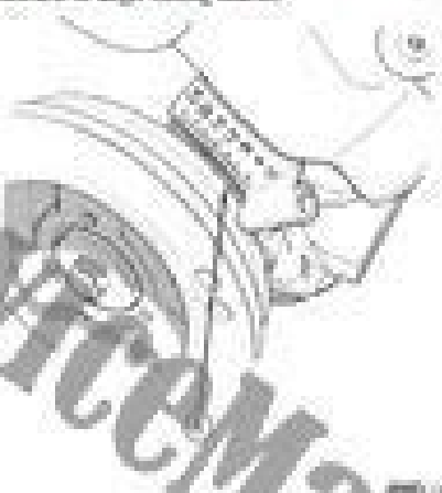
Fig. 11 Align Timing Marks

(6) Slowly continue to rotate engine. Do this until timing marks on vibration damper pulley align with top dead center (TDC) mark if displayed on timing degree scale (Fig. 10). Always rotate engine in direction of normal rotation. Do not rotate engine backward to align timing marks.