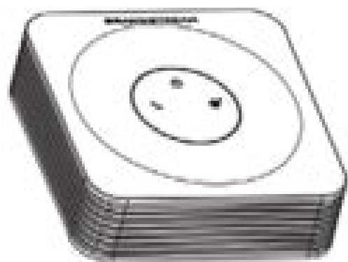
1 x HT801