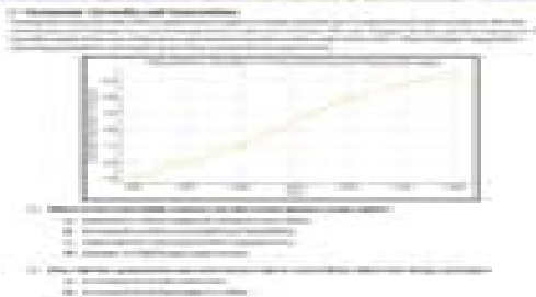
Page 1: Economy