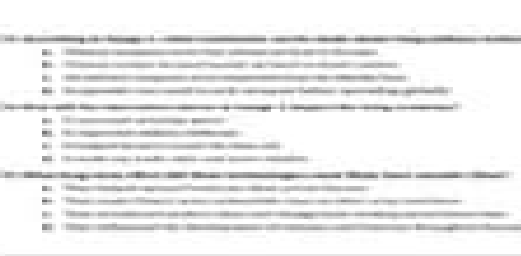
Page 5: Technology