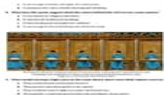
Page 3: Government