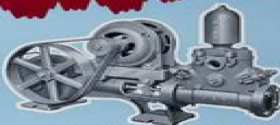
SELF-PRIMING PISTON PUMPS