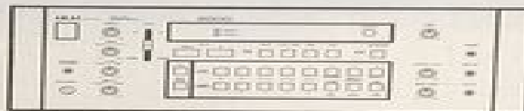
MODEL EWV 2000