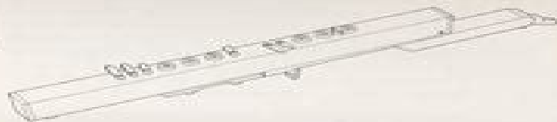
MODEL EWI 1000