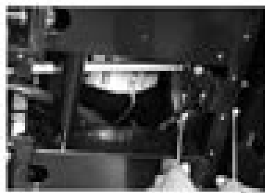
10. Install the dial plate. Secure with screws.