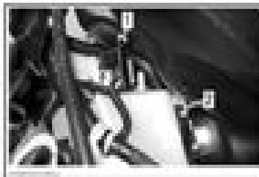
1 Disconnect air injection tank

4. Unclip THCM module from air injection tank.