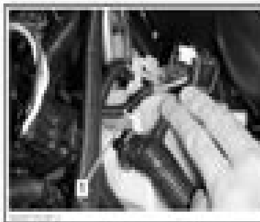
1 Locking tie

5. Cut locking tie that secures tuned pipe temperature sensor wires to air injection tank.