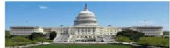
U.S. Capitol Building