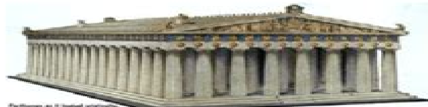
Parthenon as it had originally appeared, Athens, Greece, c. 400 B.C.

Parthenon in Ancient Greece as it would have looked in 400 B.C. (over 2,400 years ago!)