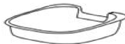
Stainless Steel Bowl