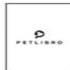
User Guide Kit