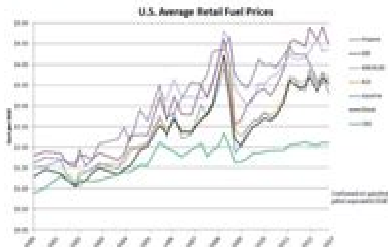
National Average Price Between January 01 and January 25, 2012