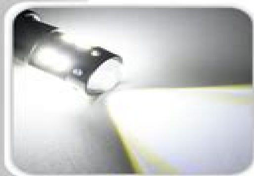
LED BULBS PW24W