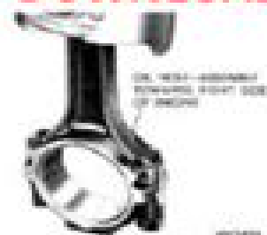
Fig. 24-Connecting Rod Oil Hole

(d) Install main screw and piston pin in piston (Fig. 25).