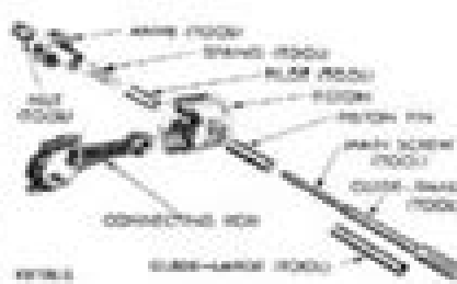
Fig. 23-Load Arrangement for Installing Piston Pin

(c) Pushes connecting rod over the pin which extends through piston hole. The oil hole in connecting rod must point toward the direction shown in Figure 24.