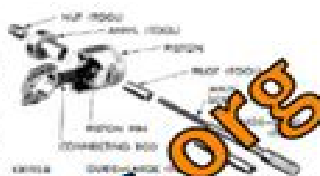
Fig. 21-Installing Piston Pin