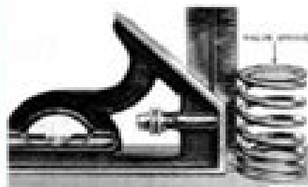
Fig. 16-Inspecting Valve Spring Separators The tip width length is within limits.

(3) Install new tip width on all valves shown (read and see intake valve and check and see exhaust valve) and cover valve guide (Fig. 14 and 15). Install valve springs and retainers.