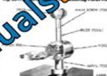
Fig. 22-Removing Piston Pin

(b) Place piston, with "Head First" up, over the pin so that pin extends through piston pin holes.