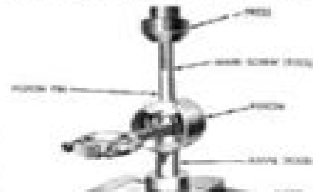
Fig. 27-Installing Piston Pin

(3c) Attach torque wrench to nut and test torque up to 55 foot-pounds. If connecting rod moves down-