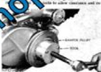
Fig. 18-Removing Vibrating Damper Assembly

(1) Break crankshaft until No. 4 exhaust valve is closing and No. 8 intake valve is opening. Install a dial indicator on that indicator pointer contacts valve