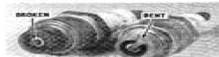
Damaged spark plugs. Notice the broken electrode on the left plug. The broken part MUST be found and removed before returning the engine to service.

When purchasing new spark plugs, ALWAYS ask the marine dealer if there has been a spark plug change for the engine being serviced.