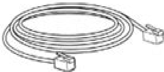
1 x Ethernet Cable