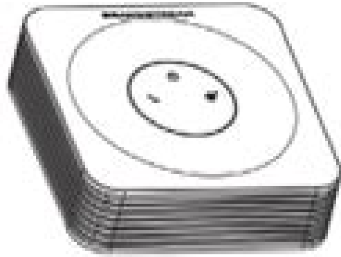
1 x HT801