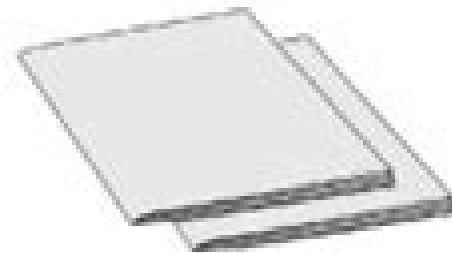
1 x Quick Installation Guide 1 x GPL Statement