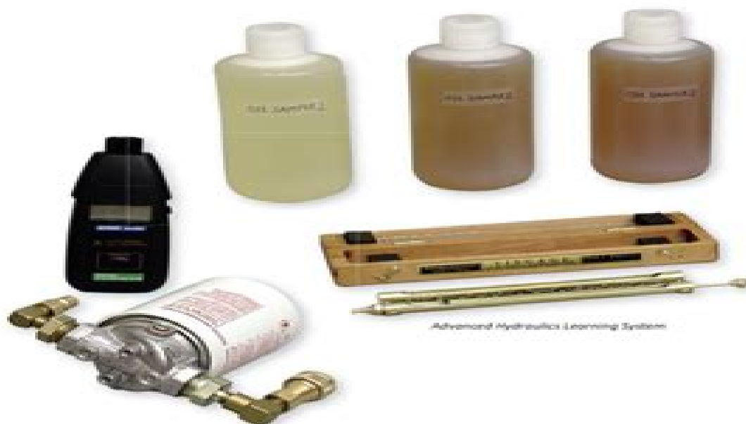
Advanced Hydraulics Learning System