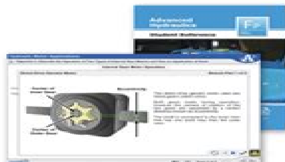
Multimedia Curriculum and Student Reference Guide