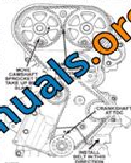
Fig. 25 Timing Belt—Installation