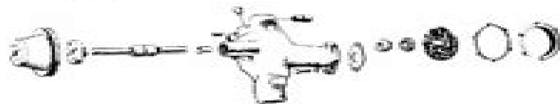
352", 390", 410", 427", 428", 430", 462" ENGINES WATER PUMP