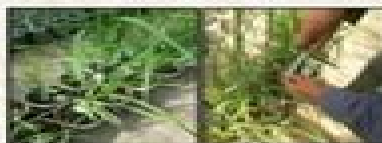
Fig. 2. Artificial inoculation of Pi9061 ( Xa4 ) and Pi9065 ( Xa7 ) by clipping method 45 DAS.