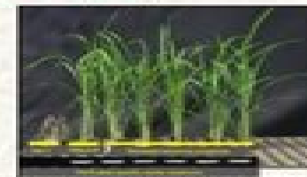
Fig. 3. Ca43 isolate reactions of RP, DR, and improved backcross progenies. Probes were taken 14 days post-inoculation.