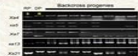
Fig. 5. Segregation of backcross progenies at the R-gene loci.