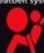
Airbag and seatbelt system