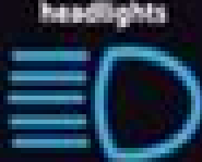
Main beam headlights