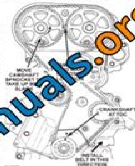
Fig. 29 Timing Belt—Installation