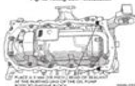
Fig. 30 Oil Pan Sealing