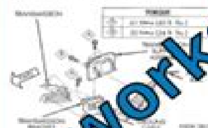
Fig. 27 Engine Mounting—Left