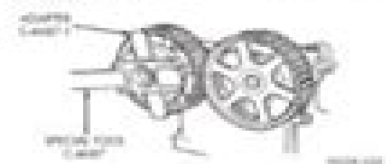
Fig. 41 Crankshaft Sprocket—Removal/Installation

CAUTION: Do not rock shaft seal surface or seal face.