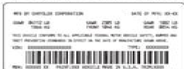
Fig. 1. Vehicle Safety Certification Label

When it is necessary to contact the manufacturer regarding service or warranty, the information on the Vehicle Safety Certification Label would be essential.