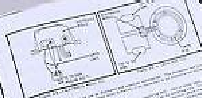
Figure 1 shows a method of shooting the ignition system. It is a method of testing the ignition system by means of a switch and a lamp. The switch is connected to the ignition system and the lamp. When the switch is closed, the ignition system is tested and the lamp glows. This method is used to test the ignition system and to demonstrate the discharge of a capacitor.

The capacitor discharge method is a method of discharging a capacitor by means of a switch and a lamp. The switch is connected to the capacitor and the lamp. When the switch is closed, the capacitor discharges and the lamp glows. This method is used to test capacitors and to demonstrate the discharge of a capacitor.