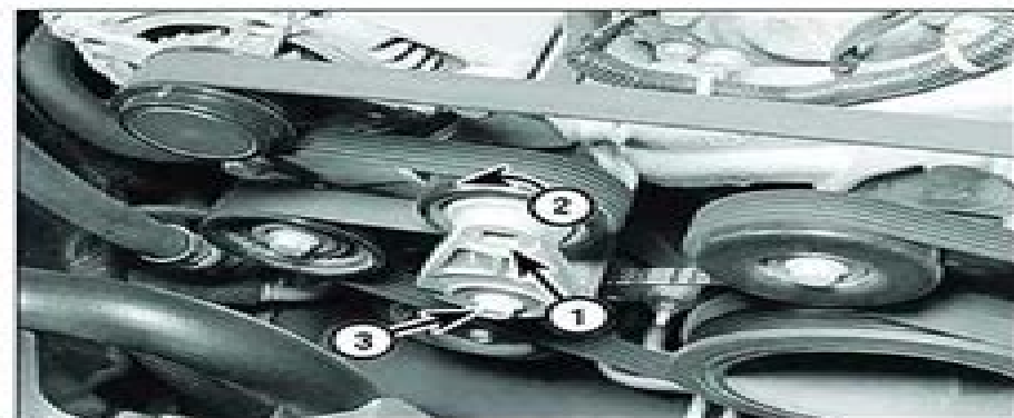
12.6a V6 engine accessory drivebelt tensioner details

lengthwise cracks, or missing pieces that cause the belt to make noise, are cause for replacement.