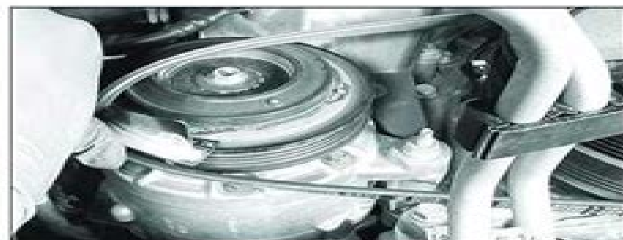
12.13 Install the belt installation tool and rotate the crankshaft pulley until the belt is lifted onto the pulley

glazing which gives the belt a shiny appearance. Check the pulleys for nicks, cracks, distortion and corrosion.