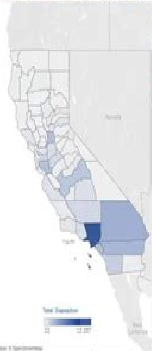
FIG. 2 Average Daily Population for Q4 of 2023

Note: Total percent ADP may not add up to 100% as the following jurisdictions do not provide a breakdown of the sentenced and unsentenced populations by offense type: Mendocino, Butte, San Diego, Kern, Butte, Santa Barbara, Tehama.