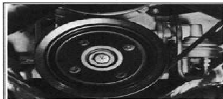
Fig. 6A6-22—Balancer and Pulley

3. Install cylinder head as previously described.