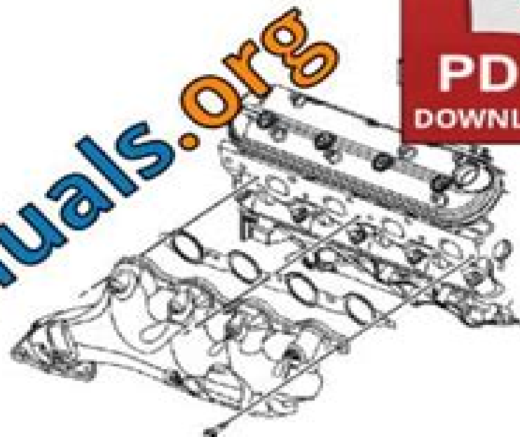
Fig. 9: View Of Exhaust Manifold, Gasket & Bolts Courtesy of GENERAL MOTORS CORP.

• Do not apply sealant to the first 3 threads.