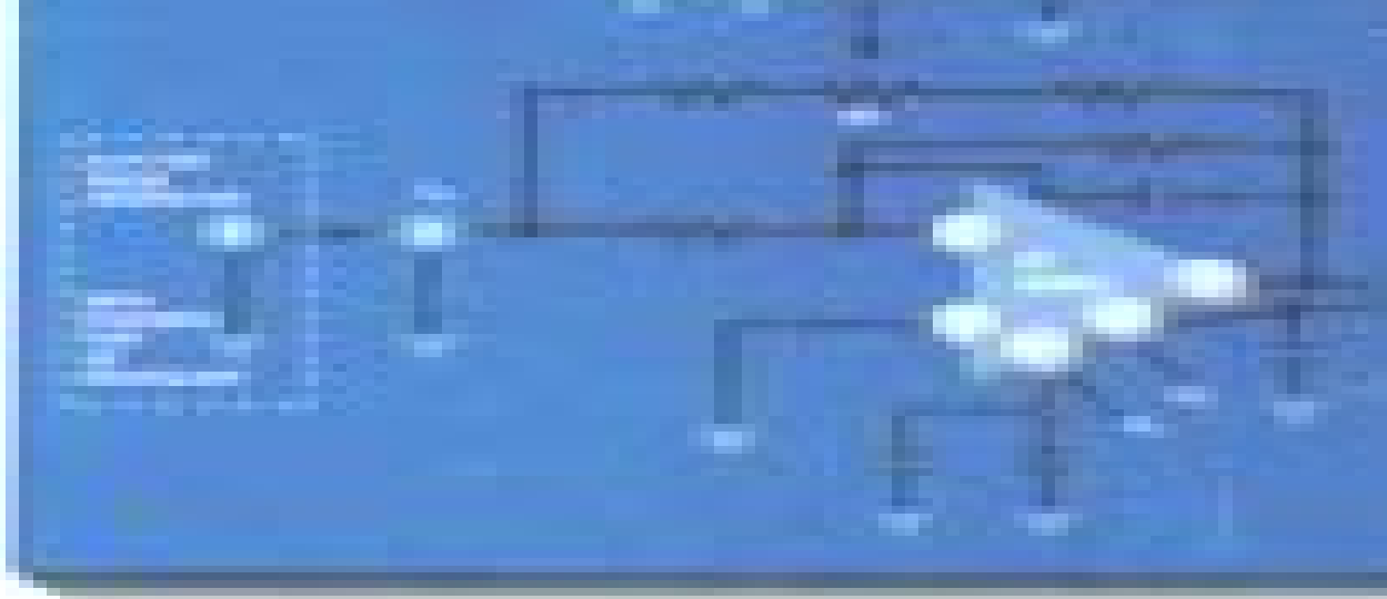
Figure 1. A 4-bit ripple-carry adder circuit. The carry-out of each stage is connected to the carry-in of the next stage. The final carry-out is connected to a light bulb, which is labeled 'Carry out'.