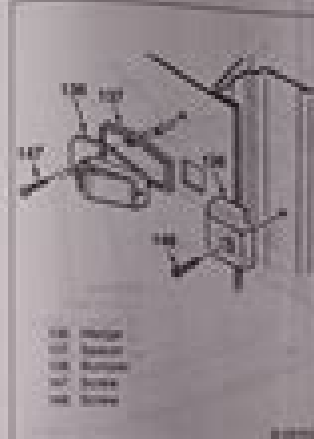
Copyright © 2004 John Wiley & Sons, Inc.