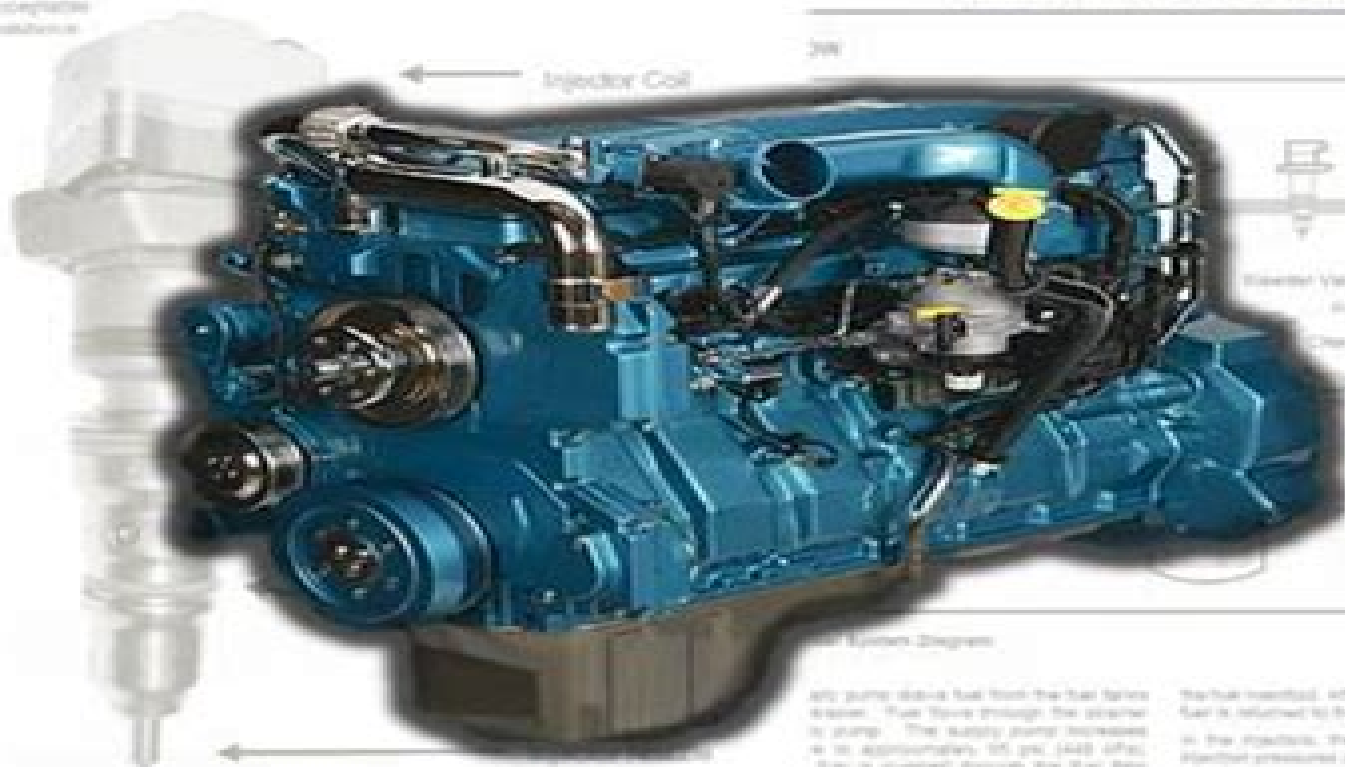
1 ENGINE CONTROL SYSTEM OVERVIEW