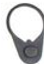
Stock Latch Plate