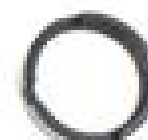
Stock Lock Ring/Castle Nut