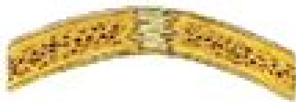
Gambar 19 Sambungan serabut, Articulatio fibrosa , contoh: sambungan tulang tengkorak ( suturæ cranii )