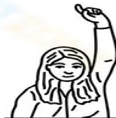
ask for help