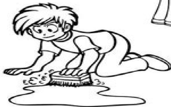
clean it up