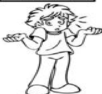
I don't know