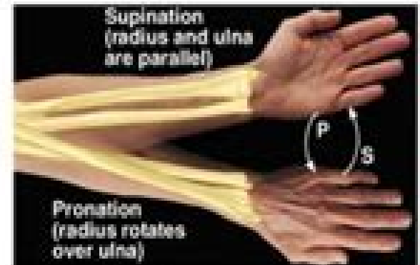
(g) Supination (S) and pronation (P)