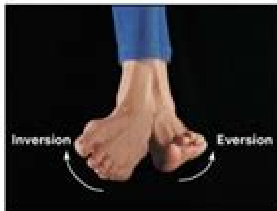
(f) Inversion and eversion